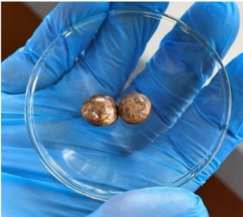
Photo 1 – Copper extracted from the Mocoa deposit at CIMEX of the National University of Colombia

"Colombia is moving away from oil, gas and coal, industries that represent half of the country's exports, towards a green economy; away from extraction to a model of production, with transition metals at the base. Copper is the core to capture, store and transmit these new sources of energy. This milestone of the first copper production in Colombia is a testament to our shared commitment to creating a fully vertically integrated, clean energy system and a renewed focus on innovation and job creation within Colombia," comments Ian Harris, President & CEO. "Mocoa is the largest copper resource in Colombia and critical to positioning Colombia as an international leader in clean energy production. We are working with the government to create a roadmap for Mocoa through copper production, with emphasis on the inclusion of national universities and our communities."