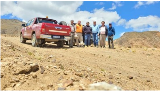
Photo 2 – Representative of the Ministry of Mines, San Juan and the Libero team visiting the Esperanza project site