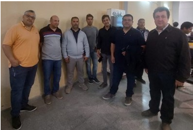
Photo 4: The Libero team meeting with authorities of the Association of Mining Service Providers of Jáchal, San Juan

Libero Copper is holding regularly scheduled meetings with local land owners and local authorities, who are looking forward to initiating geological studies at the project. In the preliminary review, the company representatives provided an update on the progress associated with community relations and residents that are interested in working with Libero Copper. Libero Copper is strongly committed to defending climate change, the energy transition, environmental protection and especially clean water.