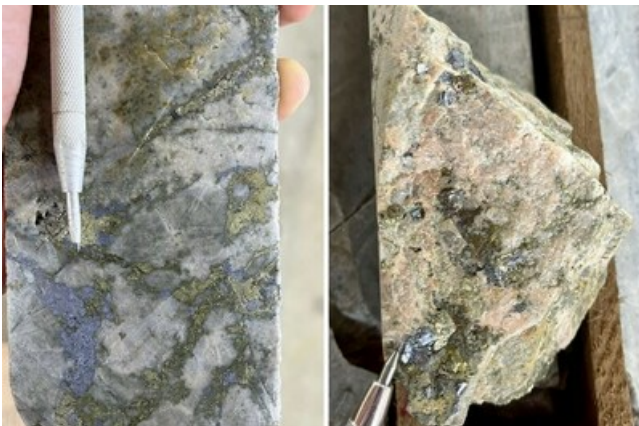
Photo 4: Core from the Mocoa porphyry copper-molybdenum project showing copper and molybdenum mineralization.

Copper-molybdenum mineralization is associated with dacite porphyry intrusions of the Middle Jurassic age that are emplaced into andesitic and dacitic volcanics. The Mocoa porphyry system exhibits a classical zonal pattern of hydrothermal alteration and mineralization, with a deeper central core of potassic alteration overlain by sericitization and surrounded by propylitization. Mineralization consists of disseminated chalcopyrite, molybdenite and local bornite and chalcocite associated with multiphase veins, stockwork and hydrothermal breccias. The Mocoa deposit is roughly cylindrical, with a 600 metre diameter. High-grade copper-molybdenum mineralization continues to depths in excess of 1,000 metres.