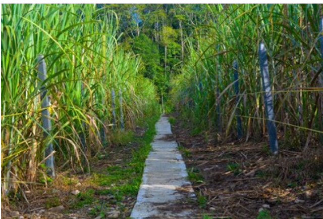
Photo 2: Section of the San Jose Access in Harmony with Local Development.