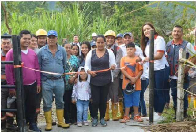
Photo 1: Ribbon Cutting Event with the Community of Montclar for the San Jose Access.

VANCOUVER, BC, Feb. 2, 2023 /CNW/ - Libero Copper & Gold Corporation (TSXV: LBC) (OTCQB: LBCMF) (DE: 29H) ("Libero Copper") is pleased to announce the completion of the new San Jose access to the Mocoia porphyry copper-molybdenum project located in Putumayo, Colombia. The access is 2,100 metres in length for the transport of drills and supplies, which eliminates expensive helicopter support for drilling activities around the deposit area. In accordance with the cooperation agreement signed with Montclar (see news release November 29, 2022 ), the access was co-planned with the community. The process ensures the new San Jose access supports the advancement of the project and the long-term development plans of the community of Montclar including improved access to established economic activities, such as artisanal raw sugarcane production.