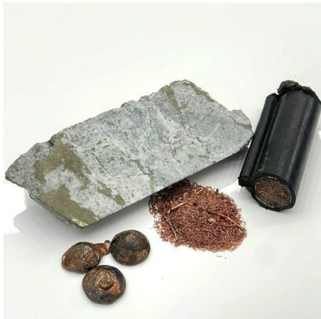
Photo 3: Drill core from the Mocoa porphyry copper-molybdenum project, copper produced together with the UNAL from the project (see news release December 6, 2022), and copper recycled in Colombia.

Libero Copper is working together with the Ministry of Industry & Commerce, Ministry of Energy & Mines, National University of Colombia ("UNAL"), local businesses, communities, and green technology start-ups to develop a copper-based production chain in Putumayo and Colombia starting with recycled copper but underpinned by the Mocoa porphyry copper-molybdenum deposit.