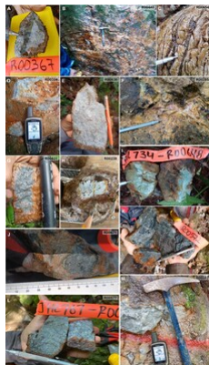
Figure 3. Highlighting rock samples in figure 2, showing the lithology, alteration and veining observed. A). Rock sample R00367 showing strong-sericite alteration in the upper part of the Mocoa porphyry with some remaining C-type veins (chalcopyrite dominant). B). Rock sample R00445 over a well-preserved stockwork mapped close to MD-045 drill pad. C). D-type veining in rock sample R00654 of a strong sericite-altered dacite porphyry in the east side of the drilled area of Mocoa porphyry. D). Strong sericite-altered dacite porphyry with up to 5% of disseminated pyrite and 15% of iron oxides in rock sample R00304 at the NW side of the drilled area. E). Strong sericite-altered dacite porphyry with up to 15% of disseminated pyrite in rock sample R00636, 1,500-metres east of the drilled area. F). Leach cap outcrop (R00285) with strong argillic alteration and iron oxides up to 30%, 800-metres south of rock sample R00636. G). Strong sericite-altered dacite porphyry with truncated and well-preserved A-type veinlet with K-spar halo in rock sample R00631, 2,600-metres east of the drilled area. H). Leach cap outcrop (R00239), southeast of the drilled area in the east side of the Tosoy creek. I). Silicified volcanic rock in rock sample R00648. J). Microdiorite with disseminated sphalerite and pyrite in rock sample R00671. K). Potassic altered microdiorite. L). Sericite-altered quartz-diorite with minor content of disseminated chalcocite in rock sample R00577. M). Strong sericite-altered dacite porphyry in rock sample R00357.

Fieldwork is a cornerstone of Libero's exploration strategy, providing the necessary groundwork to identify new drill targets and refine existing ones. This systematic approach is key for fully evaluating the scale and potential of the Mocoa system, supporting ongoing efforts to expand resources and enhance geological understanding.