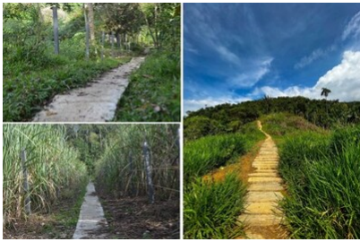
Figure 3 – Drill path improvements