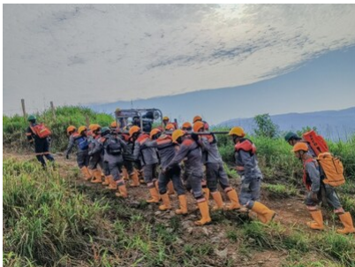
Figure 2 - Man-portable drill rig motor taken up the hill at the Mocoa project